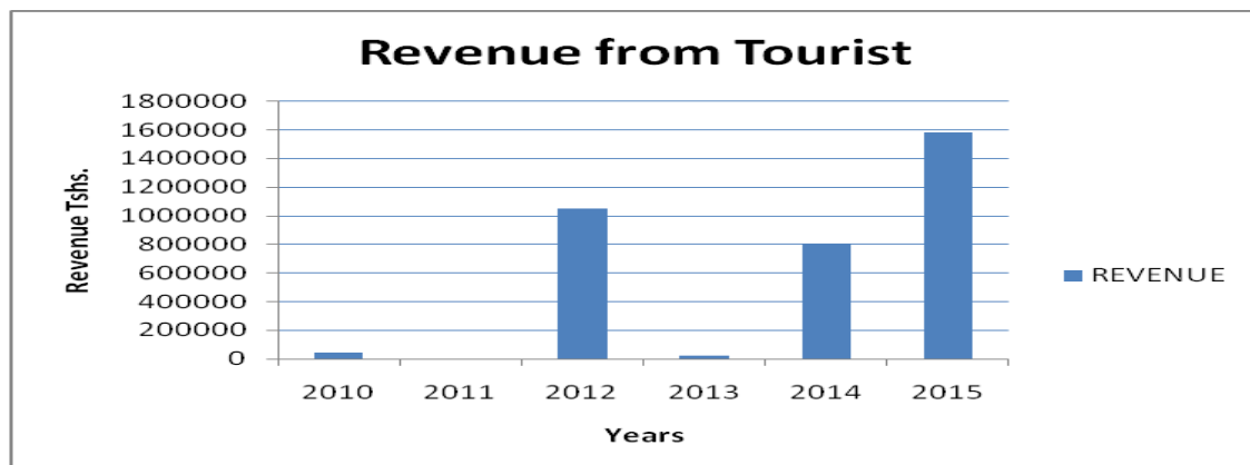
Figure 3: Revenue accrued from tourism in CNR from 2010 to 2015(CNR 2016)

Unfortunately up to this moment the communities around CNR have not yet accrued much of direct income through benefit sharing mechanism from tourism. Therefore this IGA has very little direct influence to communities behavior change towards forest conservation for the time being, but still it has a potential to have very big positive influence in the future especially after the signing and implementation of Joint Forest Management agreement for cost benefit sharing scheme. For the time being most communities are indirectly benefited by the low volume of tourism visiting the forest (there some ongoing initiative to promote tourism in CNR) through selling their goods such as handcrafts, but there is no official data recorded on how much they are earning.