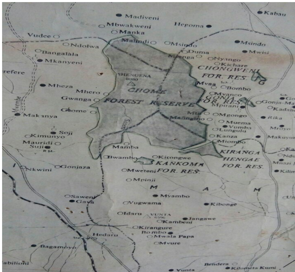
Figure: 1 Map of Chome Nature Reserve with surrounding villages

Chome Nature Reserve is among the eleven Nature Reserves (NR) in Tanzania of which is the only one among the fourteen forest reserves in Kilimanjaro region managed under TFS Northern zone. The reserve is among of eight nature reserves found in the Eastern Arc Mountains.